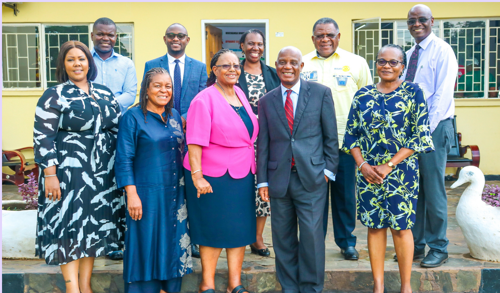
CHUDLEIGH HOUSE SCHOOL BOARD MEMBERS