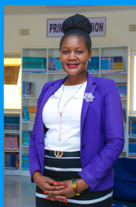
MRS. MULUSO PRIMARY SCHOOL