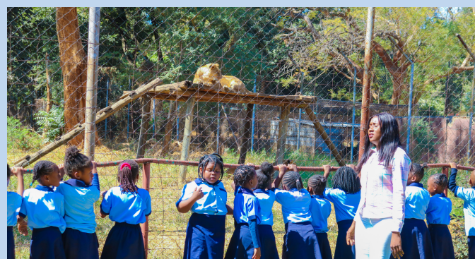
GRADE 1 TOUR OF MUNDA-WANGA