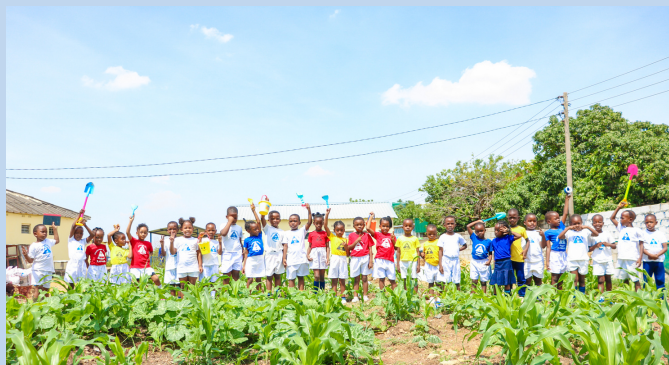
LITTLE FARMERS CLUB