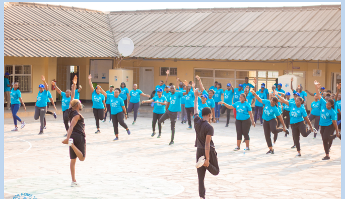
STAFF TEAM BUILDING