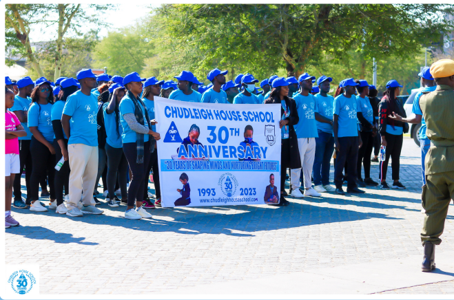
Chudleigh House School Staff preparing for the 30th Anniversary March at Easpark Mall