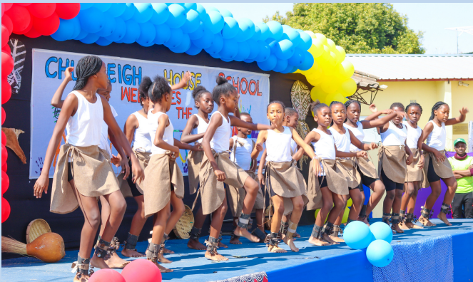
ARTS FESTIVAL - 2023