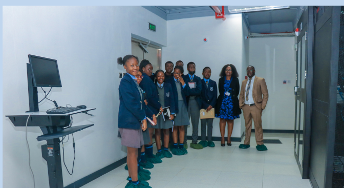
GRADE 12 TOUR OF INFRATEL