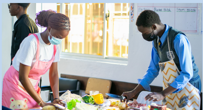
FOOD AND NUTRITION ASSESMENTS