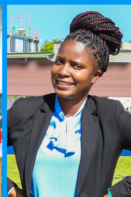
MRS. MWAMBA SECONDARY SCHOOL