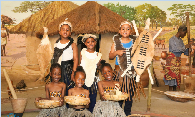
GRADE 1 TOUR OF THE LUSAKA NATIONAL MUSEUM

These images aren't just frozen moments; they are vibrant portrayals of the vibrant tapestry of our school community. Join us as we celebrate the beauty of our shared experiences, our collective achievements, and the profound bonds that unite us as one family at Chudleigh House School.