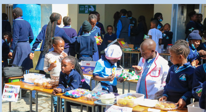
ENTREPRENEURSHIP DAY - 2023