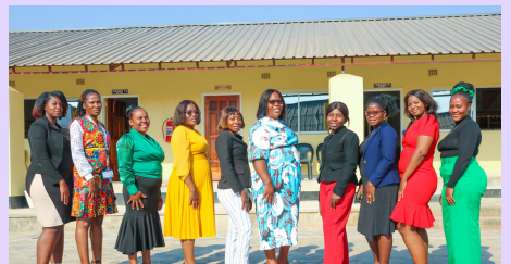
PCEL C TEACHERS