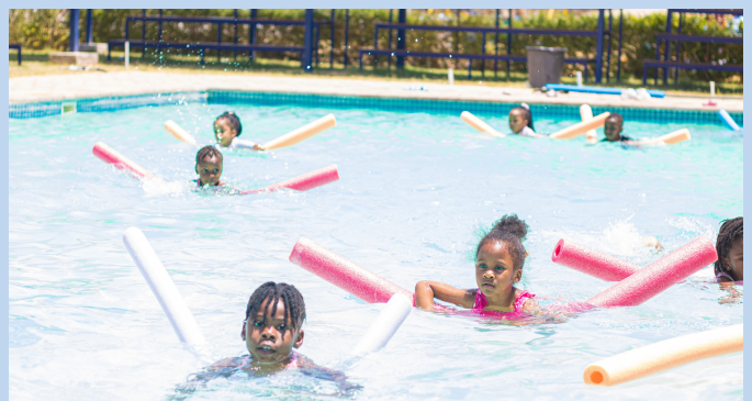
MIDDLE CLASS SWIMMING LESSONS