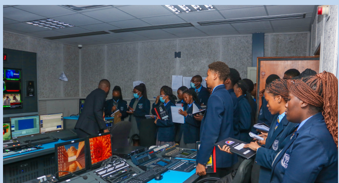
GRADE 11 TOUR OF ZNBC