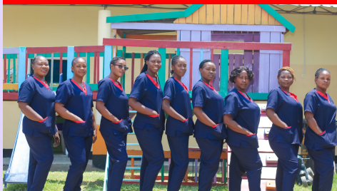
PCEL C HELPERS