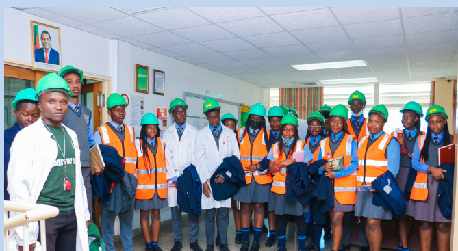
GRADE 12 TOUR OF KAFUE GORGE POWER STATION