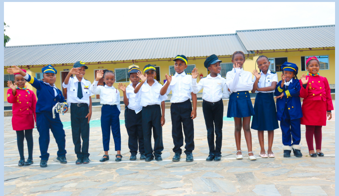
CAREERS DAY- 2023