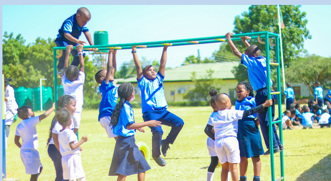
PRIMARY SCHOOL PLAY TIME