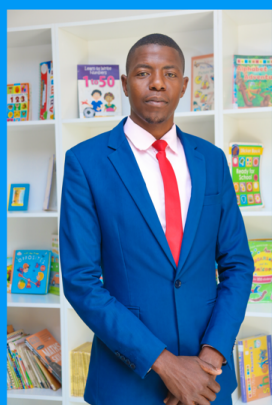
MR. JERE PRIMARY SCHOOL