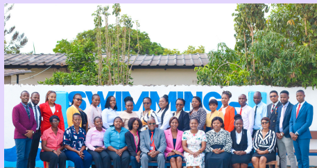
PRIMARY SCHOOL TEACHERS