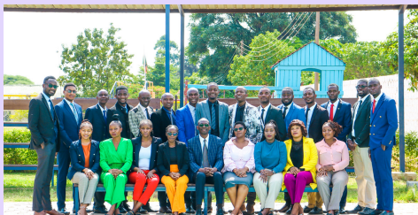
SECONDARY SCHOOL TEACHERS