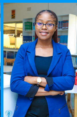
MS. FUWILA SECONDARY SCHOOL