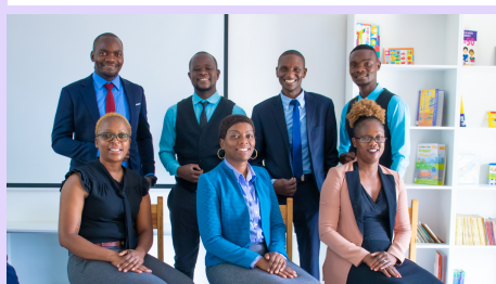
FRONT OFFICE STAFF