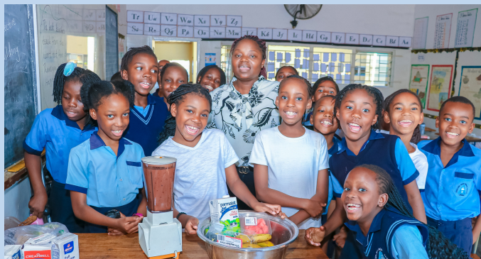
FOOD AND NUTRITION CLUB