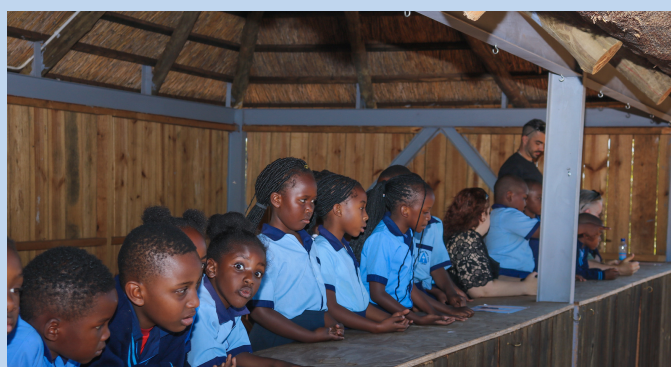
GRADE 2 TOUR OF LUSAKA NATIONAL PARK