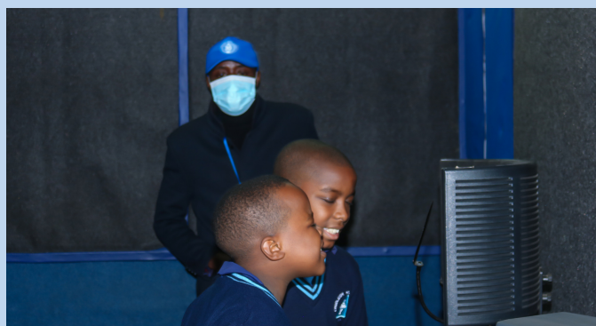
STUDIO SESSION FOR THE 'BOYS' LIVES MATTER' SONG