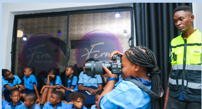
JUNIOR MEDIA CLUB TOUR OF FERN MEDIA