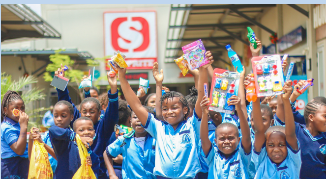
GRADE 4 SHOPRITE TOUR